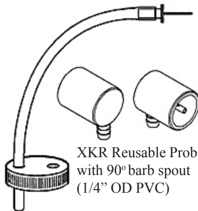
XKR Reusable Probe with 90° barb spout (1/4" OD PVC)